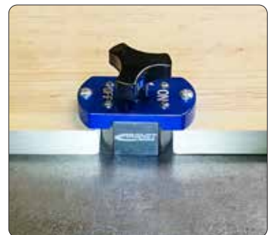
Installed flanged jig magnet.